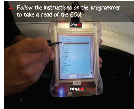
2. Follow the instructions on the programmer to take a read of the ECU.