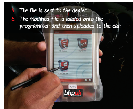
4. The file is sent to the dealer. 5. The modified file is loaded onto the programmer and then uploaded to the car.