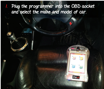
1. Plug the programmer into the OBD socket and select the make and model of car.

To request a brochure offering more details about the diesel system test and repair services offered by BHP UK circle 076